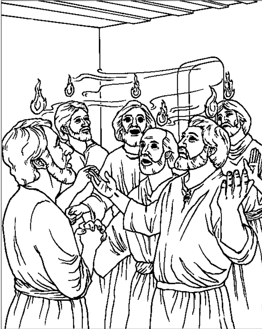
The Day of Pentecost Acts 2

Thru-the-Bible Coloring Pages for Ages 4-8. © 1986, 1988 Standard Publishing. Used by permission. Reproducible Coloring Books may be purchased from Standard Publishing, www.standardpub.com , 1-800-323-5473.