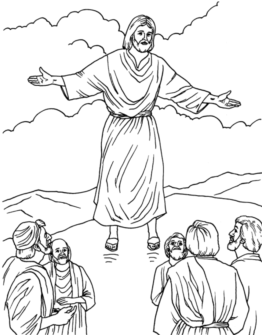
The Ascension of the Lord

From BibleStoryCard Learning System(tm) Coloring Book © 1996 Wesleyan Publishing House Used by permission. Additional BibleStoryCard resources available by calling 1-800-493-7539 or visiting online http://www.parable.com/wph/group_1052.htm