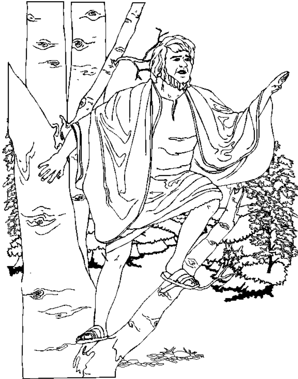
Zacchaeus climbs a tree to see Jesus!