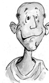
Zacchaeus