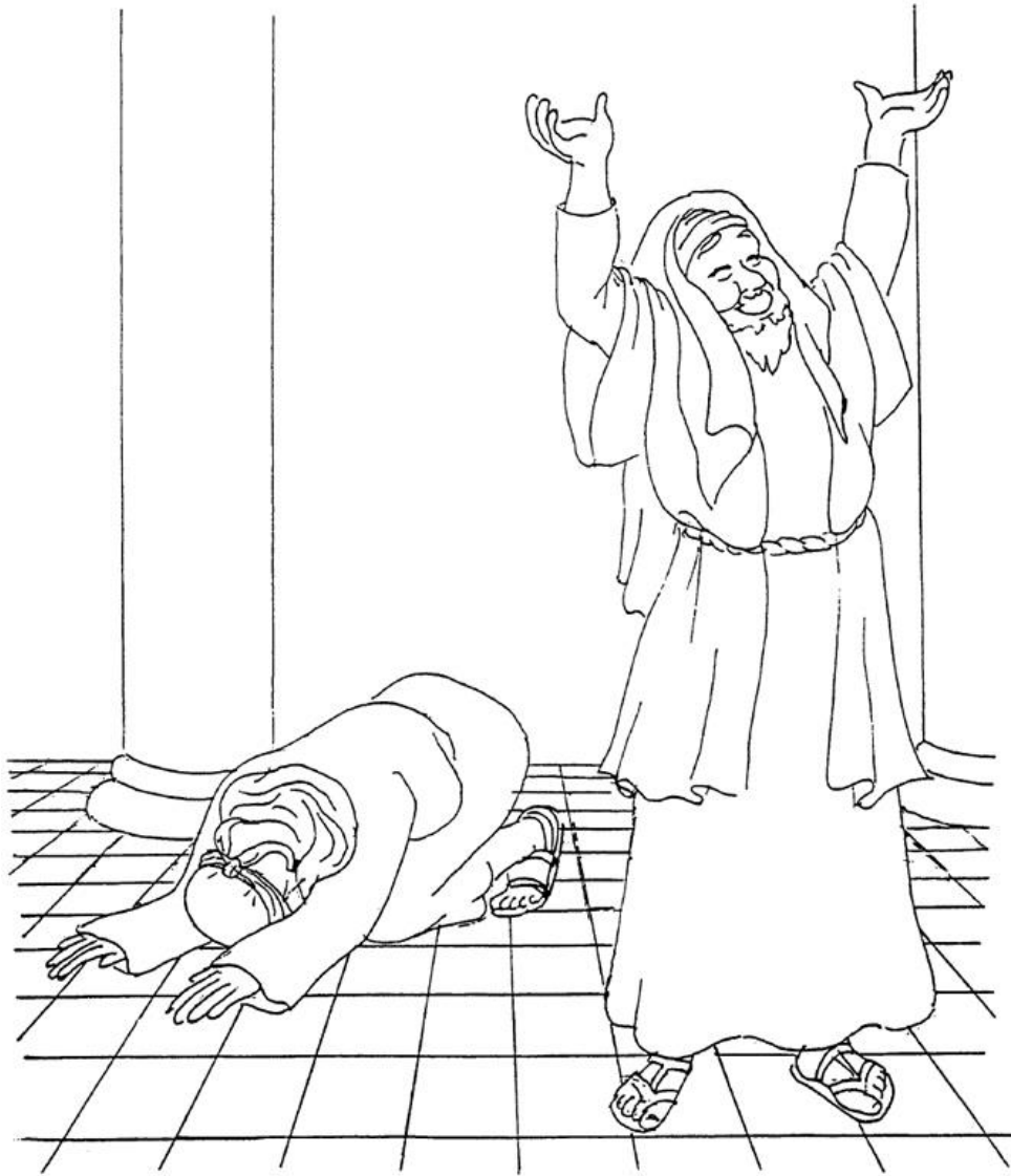
The Parable of the Pharisee and the Tax Collector