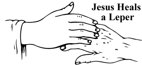
Jesus Heals a Leper