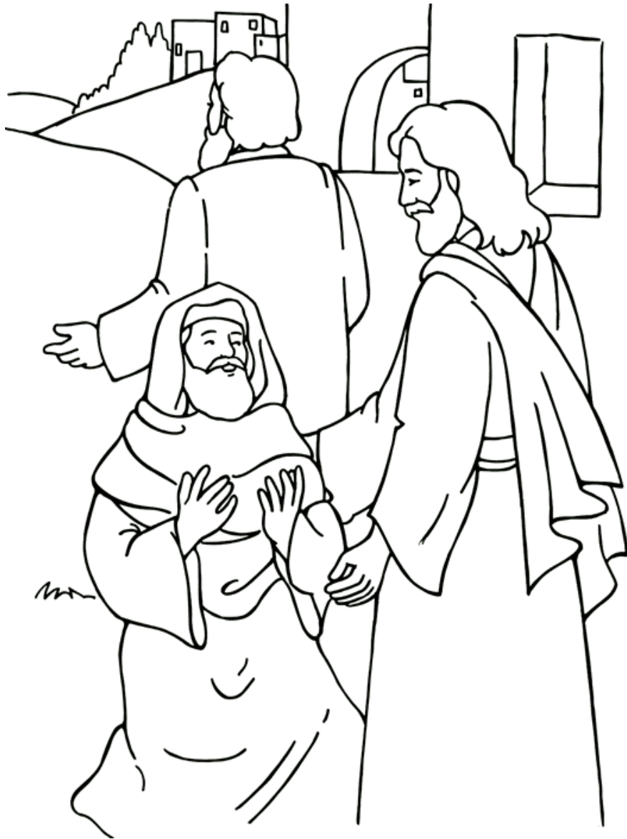
The Ten Lepers from Luke 17:11-19

From Thru-the-Bible Coloring Pages for Ages 4-8. © 1986,1988 Standard Publishing. Used by permission. Reproducible Coloring Books may be purchased from Standard Publishing, www.standardpub.com, 1-800-543-1301.