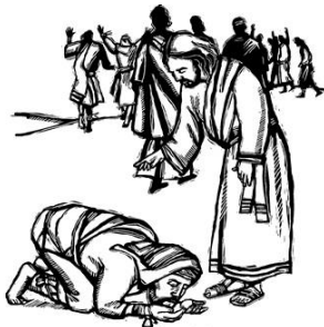
Jesus Heals 10 Lepers

Copyright © Sermons4Kids, Inc. May be reproduced for Ministry Use