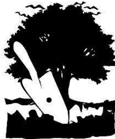
Mustard Seed Faith

Copyright © Sermons4Kids, Inc. May be reproduced for Ministry Use